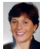
Joke Hermes Hogeschool Inholland / University of Amsterdam, The Netherlands From street credibility to media literacy